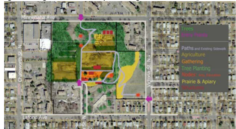
Figure 5. Frogtown Farm Conceptual Design