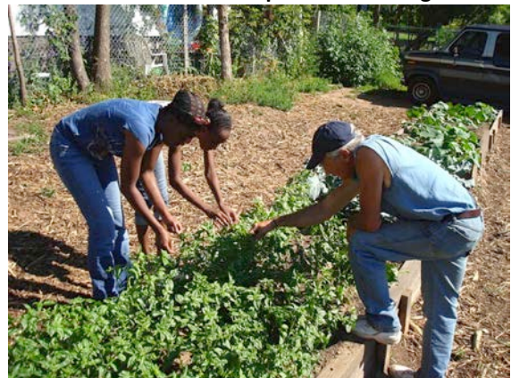
Seeds of Success Participants Harvesting Basil