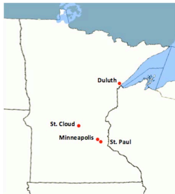
Figure 1. Study Area Map – Minnesota Municipalities Examined

Map created using National Atlas Map Maker http://nationalatlas.gov/mapmaker