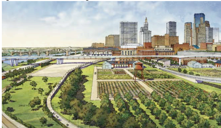
Figure 4. Lowertown Urban Agriculture Vision

Source: City of St. Paul and Cuningham Group. Greater Lowertown Master Plan Summary . December 28, 2011. http://lowertownsaintpaul.files.wordpress.com/2012/01/full-lowertown-master-plan2.pdf